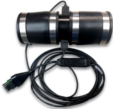
Part No. AE6705K