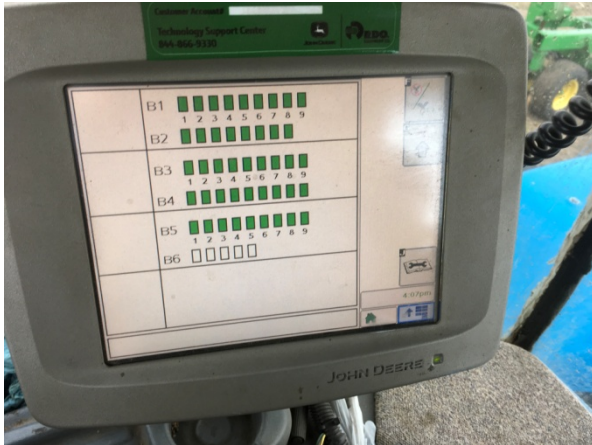
B6 on the screen shows the new member module added with 5 primary sensors

Have owners of the JD1910 air cart complained about primary tubes plugging and only finding out after the crop comes up that it happened? Now it can be monitored with a sensor available to fit on a newly designed 2.5" tube. Using the DICKEY-john® UniRate™ sensor and a new tube designed to hold the sensor, blockage or no flow through the primary tubes is a thing of the past. Primary sensor blockage can be added right to the SeedStar™ 2 blockage system with minimal installation. Call Ag Express for more