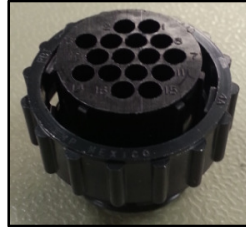
Raven™/ PP 20/20